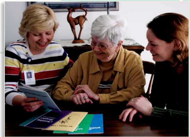
Photo: Hospice social worker and R.N. provide caregiver education and support during a home visit

The HomeHealth Partnership served 410 patients in the last fiscal year. Patients consistently provide positive feedback about the service provided, and appreciate the partnership’s close relationship with physicians at both Cuyuna Regional Medical Center and Riverwood Healthcare Center.