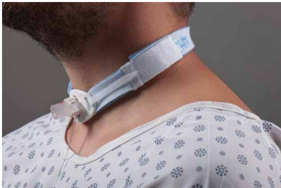
Figure 1. Example of Adjustable Tracheostomy Holder

Skin cleansing is done under the tracheostomy faceplate including under trach securing device and frequent changing of moist or soiled faceplate dressings. A standard procedure for management of tracheostomy sutures is in place. Observe for faceplate suture skin irritation and collaborate with surgeons to remove faceplate sutures at a specified protocol time-line. Observe for faceplate suture skin irritation and collaborate