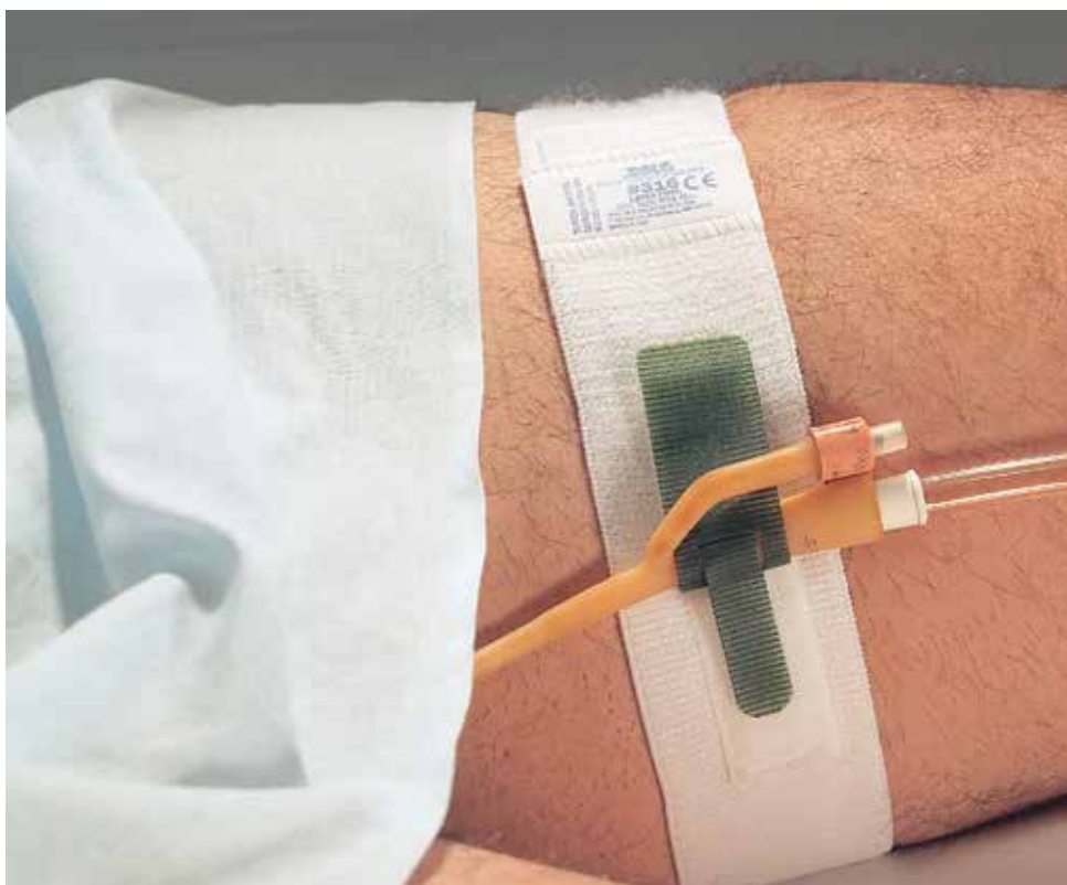
Figure 1 Example of Velcro® Locking Urinary Catheter Securement Device.

Using catheter securement to assist with prevention of device related pressure ulcers has only recently gained attention in evidence based guidelines. For the first time, a recently published International guideline for pressure ulcer prevention has a section on medical device related pressure ulcer. It clearly states that patients with medical devices should be considered at risk for pressure ulcers. 5 The incidence of device-related pressure ulcers nationwide is unknown. In 2010, 26% of full-thickness hospital-acquired pressure ulcers in Minnesota hospitals were reported to be related to medical devices 22 (MDH, 2010). Individual hospitals and organizations report medi-