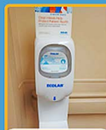
Stands with gel

Hand Rub (HR) is cleansing your hands by rubbing on special foam or gel from a Quik Care dispenser. These are usually located near patient's rooms.