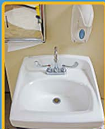
Sink with soap